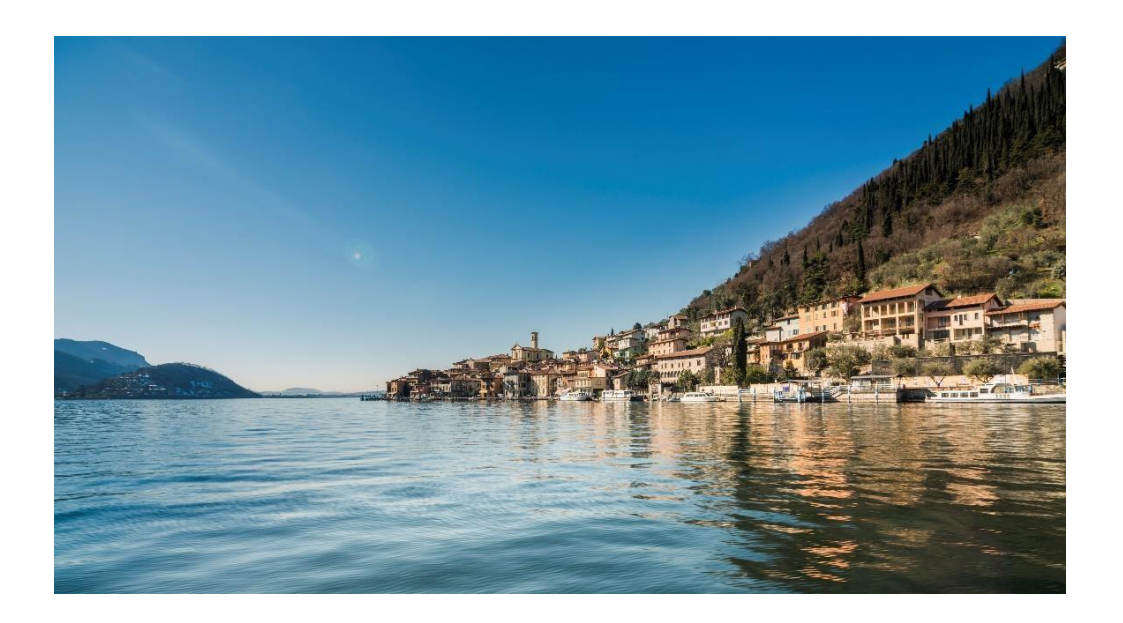
In the afternoon, you will take the ferry from Sulzano to Monte Isola. Here you can enjoy a free walk on the island.

At lunch, you will savour a traditional three-course menu with paired wines in a typical restaurant.