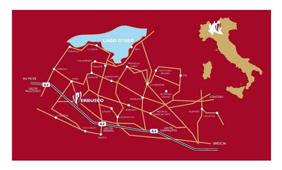
TOUR A A DAY IN FRANCIACORTA AND LAKE GARDA BY PRIVATE MINIVAN FROM BRESCIA

(Minimum number of participants: 4 people)